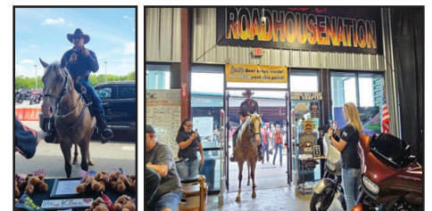
Only at OCC Road House can you see true horsepower.