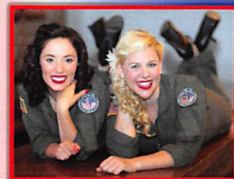
Letters From Home 6:45pm